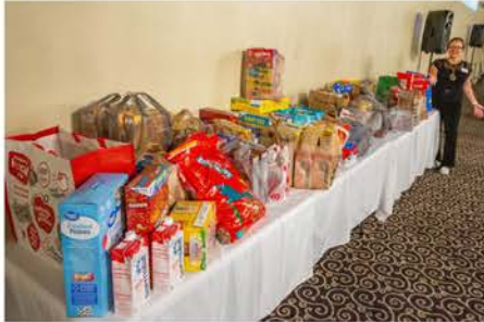
Two tables full!