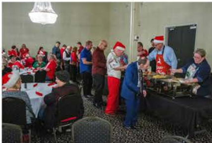
Banquet Masters did their normal out-standing job of food prep.