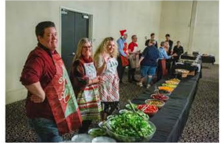
API staff members prepare to serve the special guests.