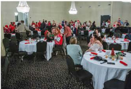
Over 100 guests and staff filled the room with fellowship and laughter.