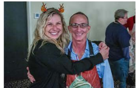
Hugs were the order of the day all around.