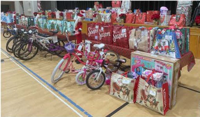
Presents ready for distribution to area foster children