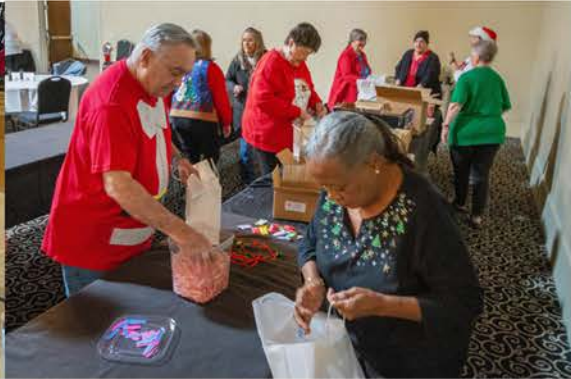
MVA volunteers prepare gift bags for special needs holiday party