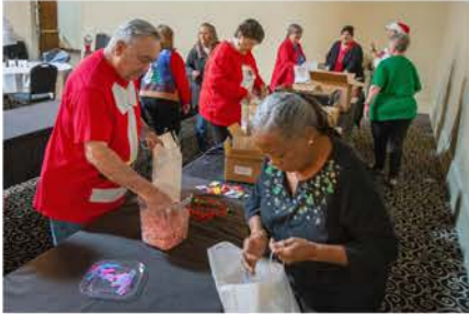
MVA volunteers prepare the gift bags. Each attendee received a gift bag filled with personal items and holiday surprises.