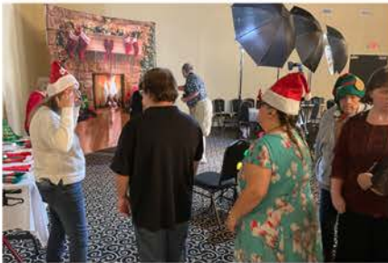
As always, the photo booth was a big hit with guests.