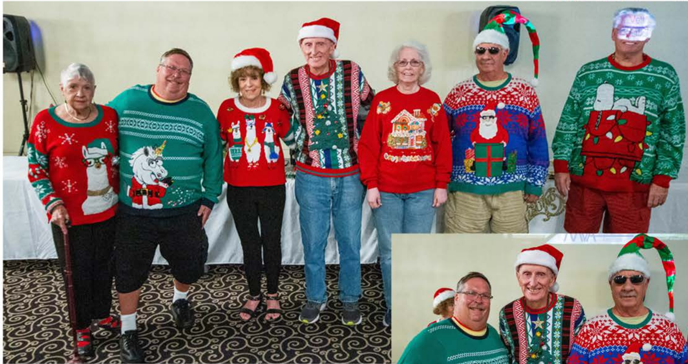
Ugly sweater contest participants (above) and winners (right)