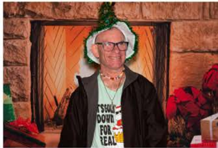
Guests received an instant photo of themselves to remember the day.