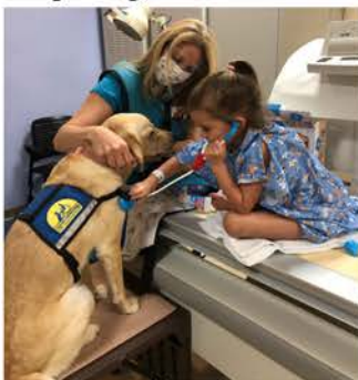
Providing support before, during & after an invasive procedure