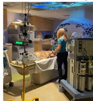
Providing support before an MRI