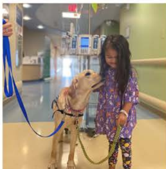
Assisting with walking and therapy