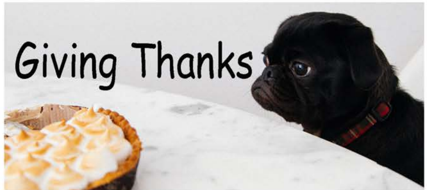
For all of life's special blessings!