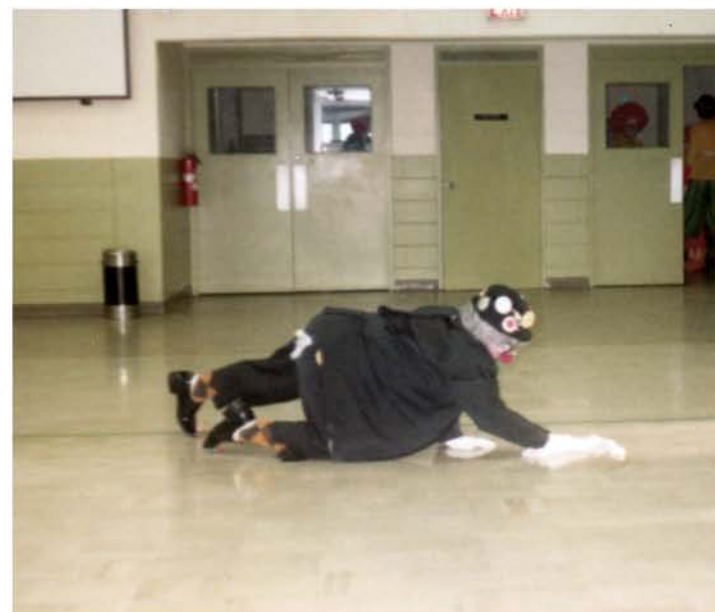
Rolling an egg across the Minnreg Hall floor.