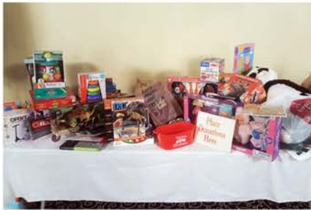
Toys collected for local Military families