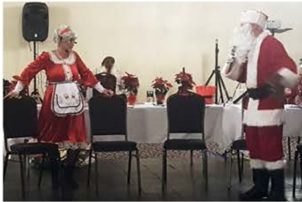
Not Ready for Primetime Players

Santa and Mrs. Claus (she apparently has no first name!) stole the show at the annual MVA Christmas party on Wednesday, December 2 at Banquet Masters. The skit was inspired, the appetizers were fabulous, the meal was delicious and the music and dancing were live! Plus we gave a whole bunch of toys to local military families. A great time all around.