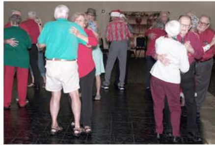
Dancing to the music of Soundwavz