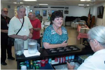
Gathering at the watering hole

What a great time and what a great venue for our Friday festivities. These gatherings give all of us a chance to catch up with each other, exchange war stories about HI days, talk about sports, TV and a whole host of other topics. Dinners are always great, and adult beverages help make the time even better. If you are not joining us on first Fridays, you might reconsider!