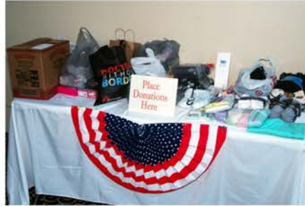
A table full of donations for homeless women