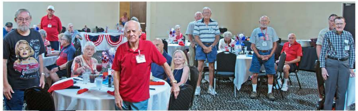
We honor our military veterans